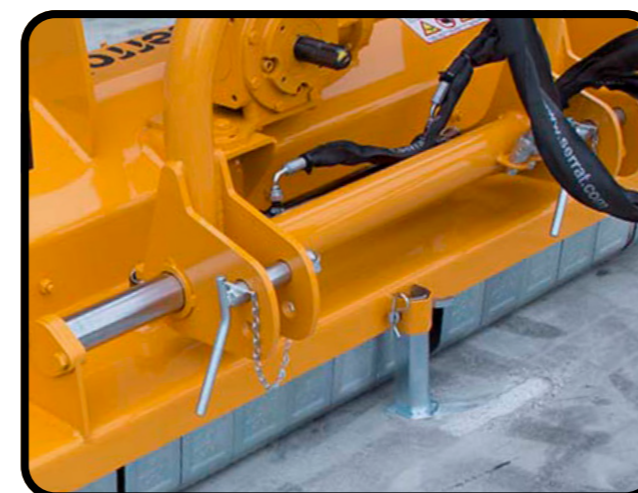
▶ Hydraulic side shift